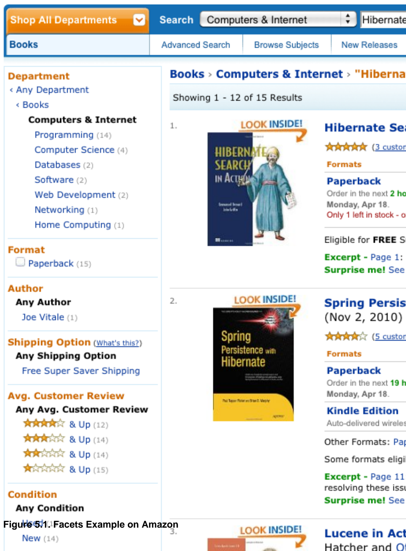
Figure 5.1. Facets Example on Amazon