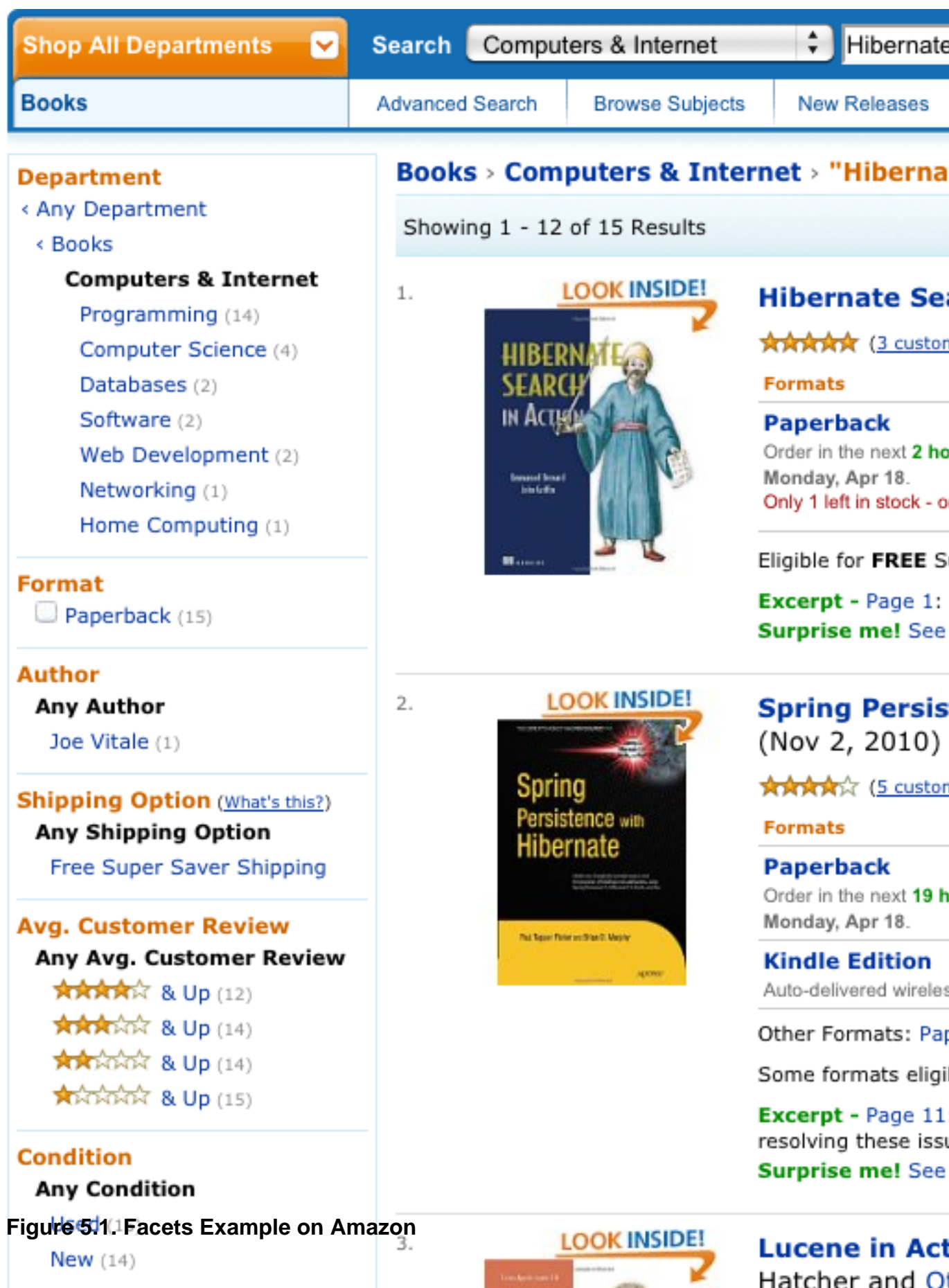
Figure 5.1. Facets Example on Amazon